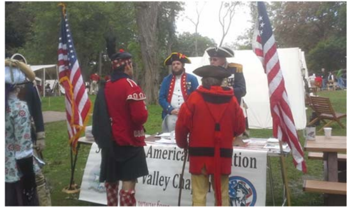
Good traffic at our table through out the day. Passed out lots of literature. Hopefully this will lead to future members