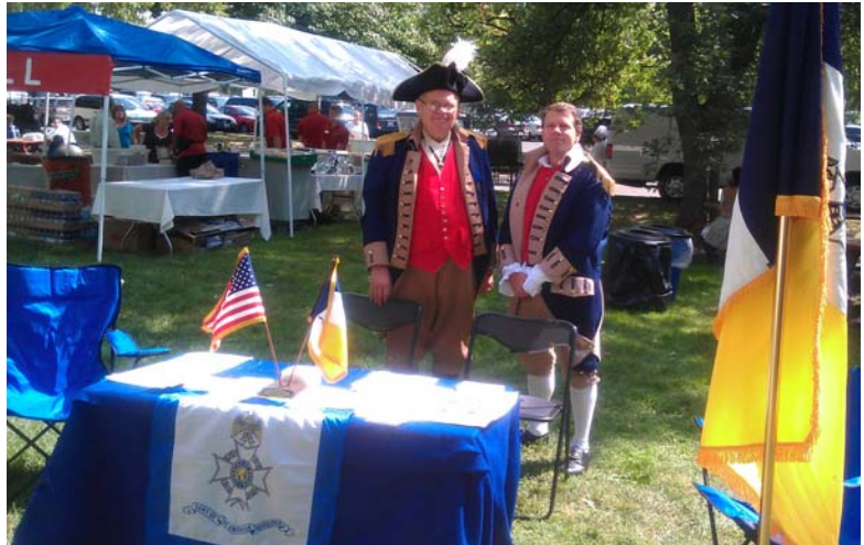
Compatriots manning the ISSAR recruiting table at Revolutionary Reenactment, Cantigny Park September 10-11, 2011

More than 400 Revolutionary War reenactors were at Cantigny, many of whom pitched tents and camped on the grounds. Redcoats and patriots consumed the Parade Field twice each day, engaging in mock battles complete with cannon and musket fire.