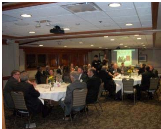
Fall Dinner at Ashbury's