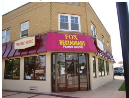
Fox Restaurant 4700 Main Street Lisle, IL 60532 (630)964-6984